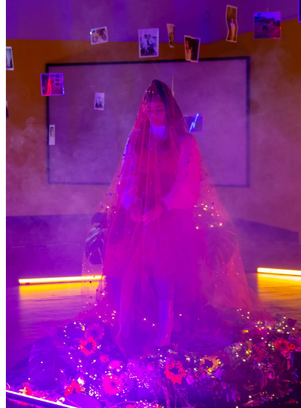
Jannawi Dance Clan at FCMG, 2020.

This intimate gathering provides opportunity to discuss ideas of self-determination, truth telling and agency from a First Nations female perspective.