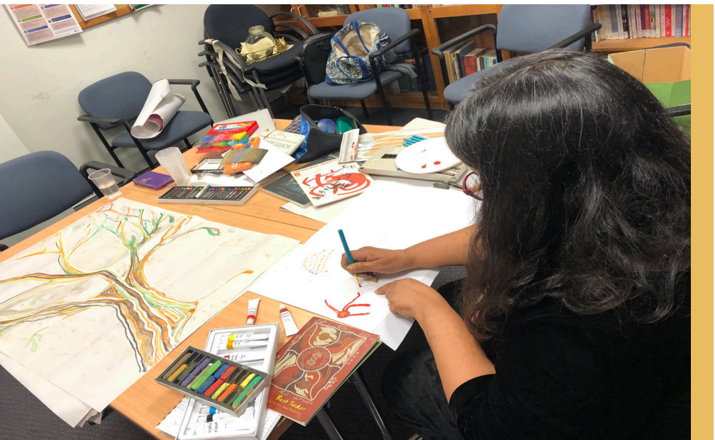
Westmead Hospital Balcony workshop

The collaborations began with the staff at Blacktown and Mount Druitt hospitals and continued with the Cardio Thoracic and the General Intensive Care Unit at Westmead Hospital; using funds from the Australia Council for the Arts to support health staff during COVID-19 and to create a design for the outdoor ICU balcony.