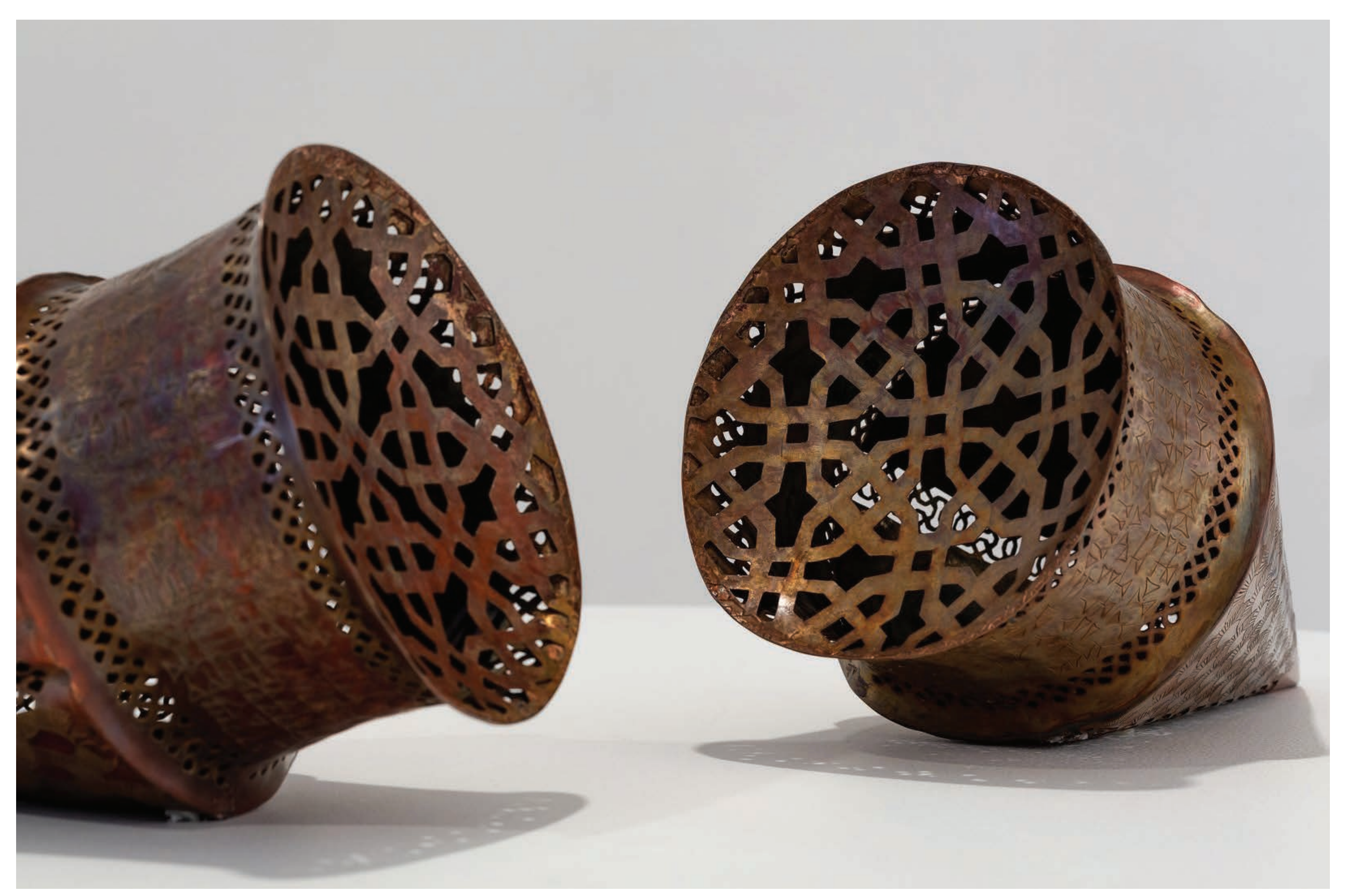
Devices for Listening, 2020, engraved and pierced copper.